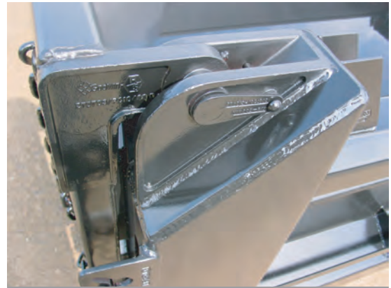
Pictured is a close view of the upper tarp friendly hardware of the standard 400USS body. This hardware makes it easy to quickly remove and reinstall the tailgate as needed

FULL FACTORY WARRANTY complete parts and service available through nationwide authorized distributors