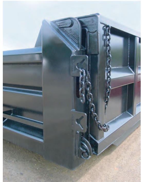
Pictured is a close view of the full-depth rear corner post with double chain adjusters and 8 gauge high tensile steel rear bolster.

Galion-Godwin Truck Body Co. LLC. 7415 Peabody-Kent Rd. Winesburg OH. 44690 P.O. Box 208 (877) 450- 4794 Fax (330) 359-5660